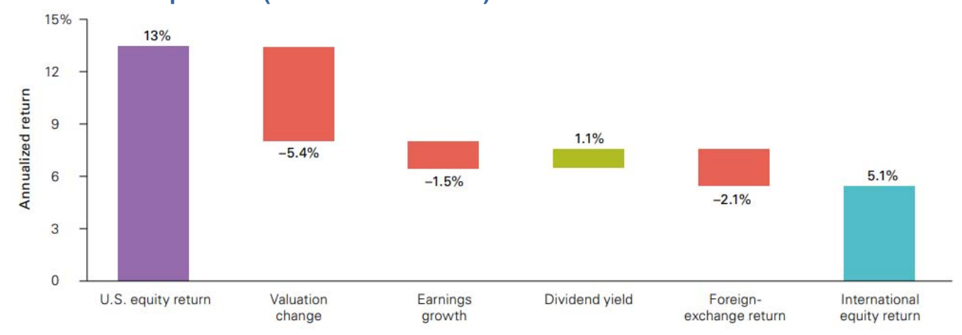
US Valuation Expansion (in the Last 10 Years)